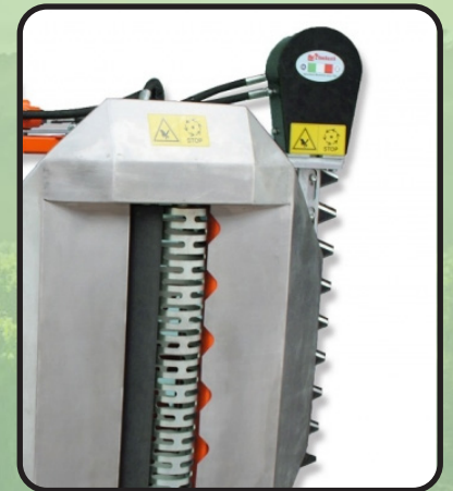
Optional 25" Cutting Bar Available