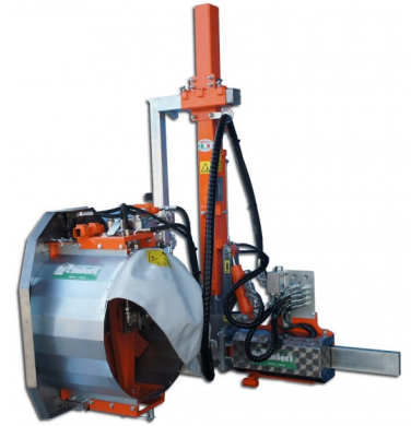
DRF Vision 1