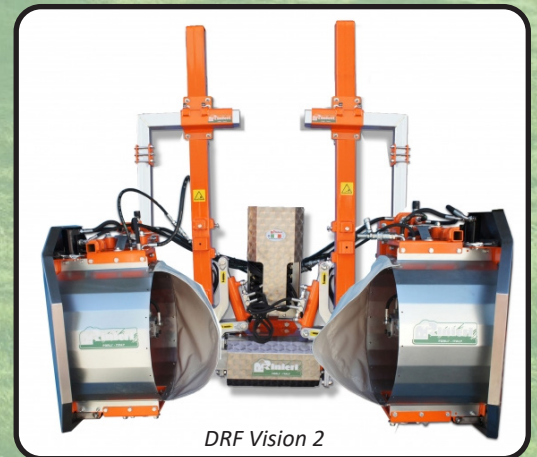
DRF Vision 2